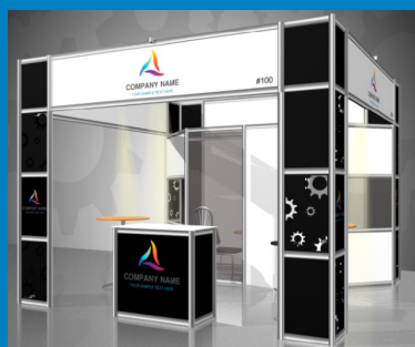
This picture is subject to modifications

850 companies 1500 participants 11000 BtoB meetings 40 countries represented