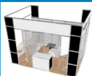
This picture is subject to modifications

- Your company logo visible on the event official website, the flyer on pdf, other marketing materials, at strategic locations at the venue, on floor plans, etc.