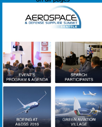
This picture is subject to modifications

Your company logo will be visible on all pages